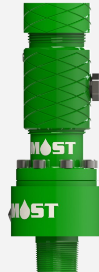
Flapper Pin end Stuffing Box