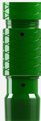
Basic Pin end Stuffing Box